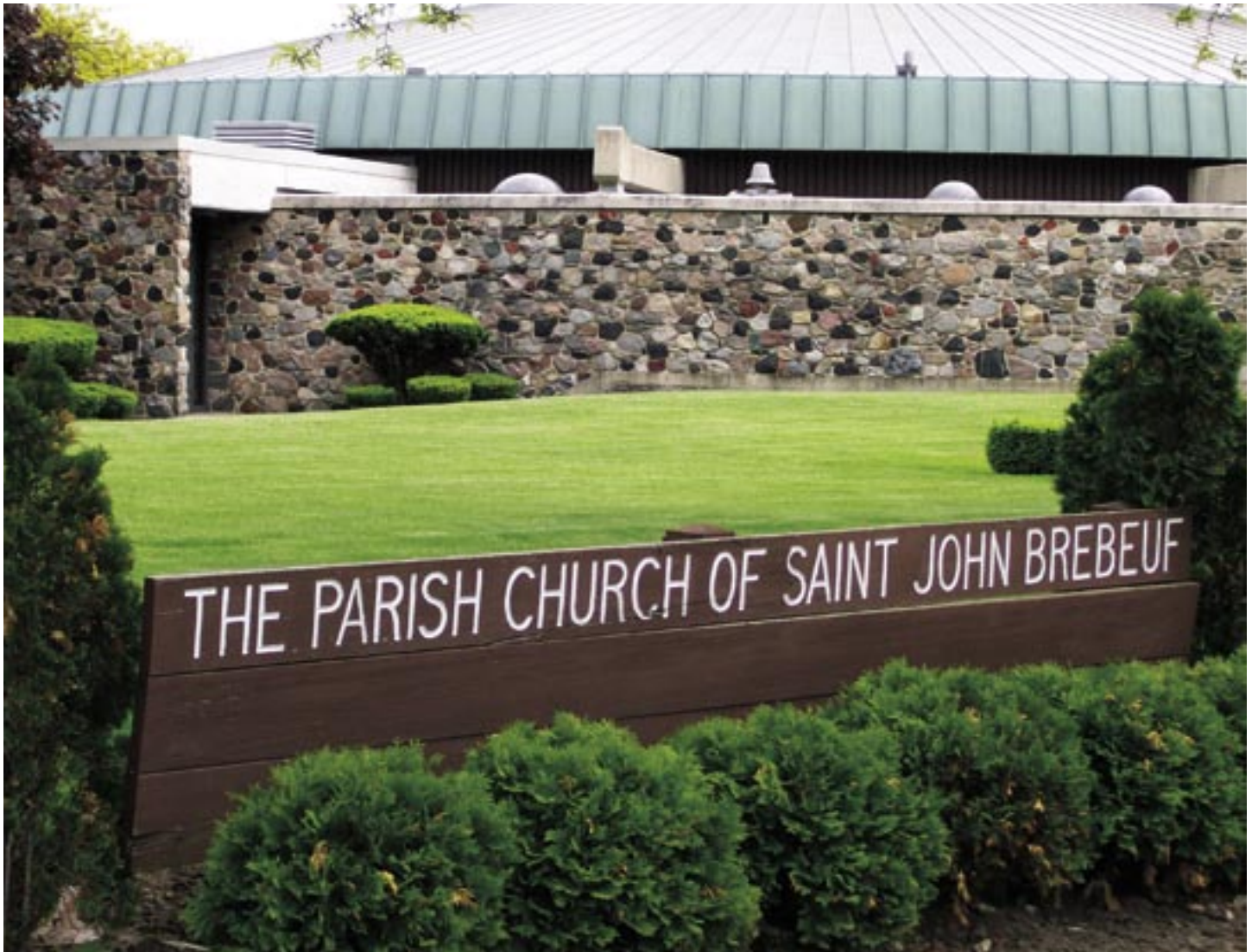
St. John Brebeuf, Niles, IL