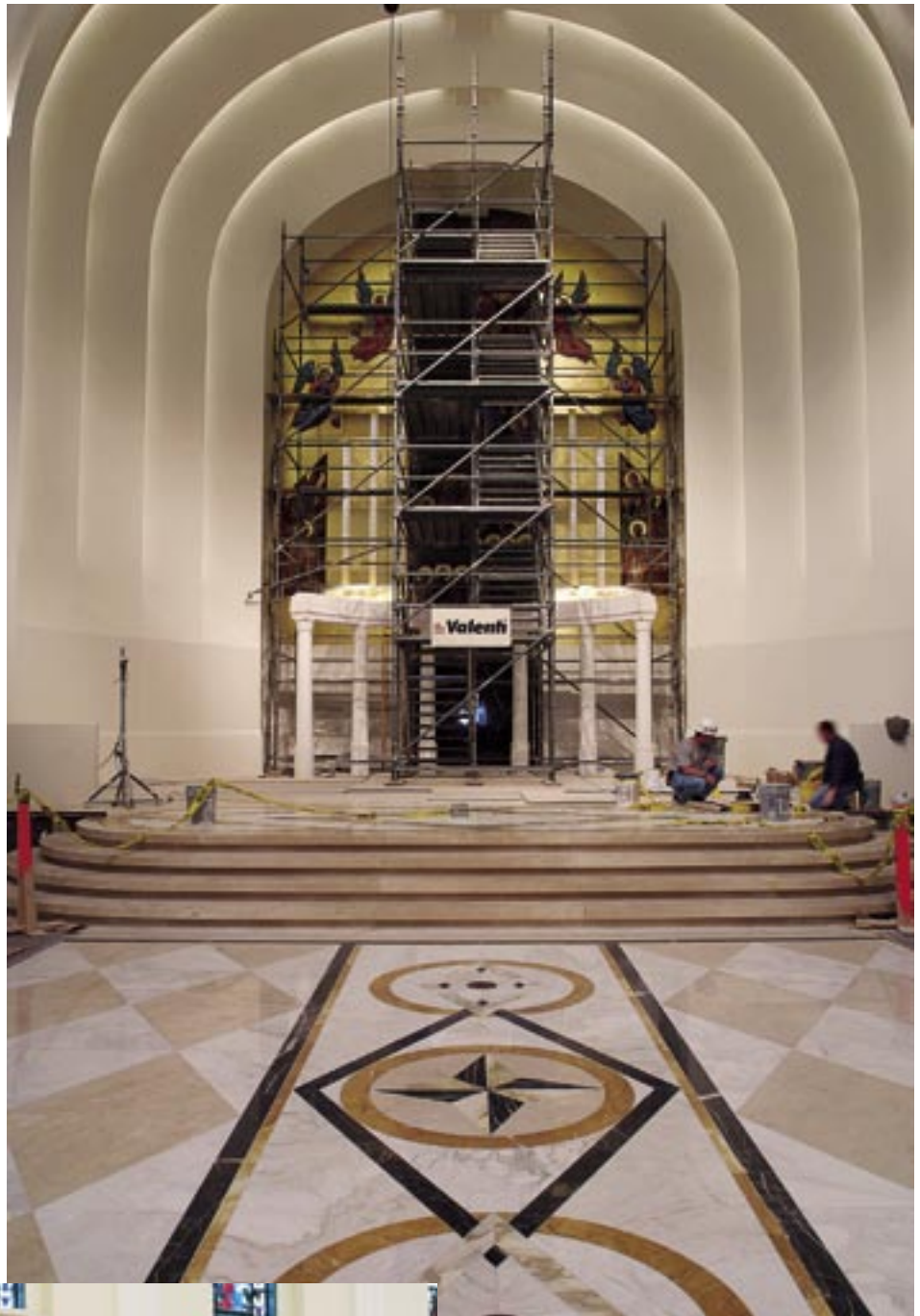
Above: The newly constructed marble floor at the Madonna Della Strada Chapel offers six distinct types of Italian marble.