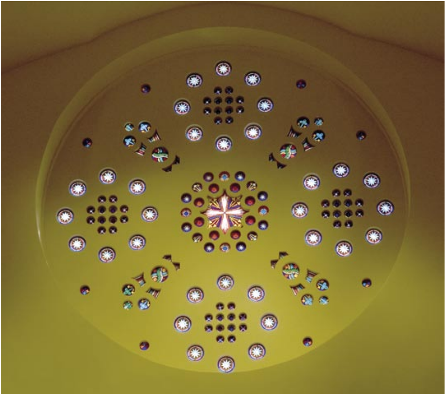
The Madonna Della Strada Chapel

artistic and architectural beauty of the structure, yet make it serve the needs of a modern congregation.